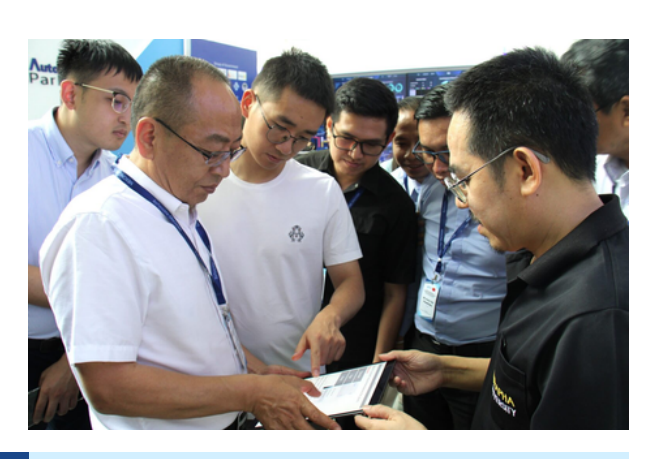
MI AND P.R. CHINA COLLABORATE TO UPSKILL LANCANG-MEKONG PROFESSIONALS FOR REGIONAL ECONOMIC GROWTH

Aiming to drive economic growth through enhanced competencies of professionals in the Lancang-Mekong (LM) region, Mekong Institute (MI), with the support of the People's Government of Yunnan Province, P.R. China, gathered 25 LM government officials from May 13 to 24, 2024, for a regional training program on human resource development (HRD).