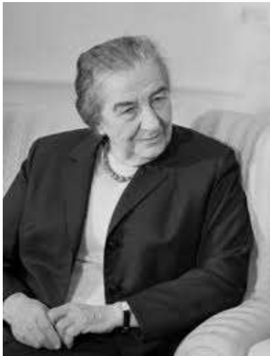
Golda Meir Minister of Foreign Affairs (1956-1966)

“We women of the world must participate in the necessary struggle against poverty, ignorance, inequality and injustice.”