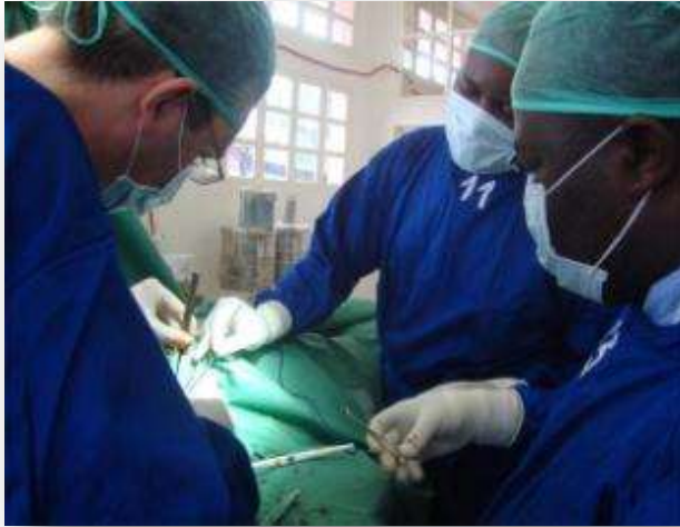
Burns Center in Eastern Congo