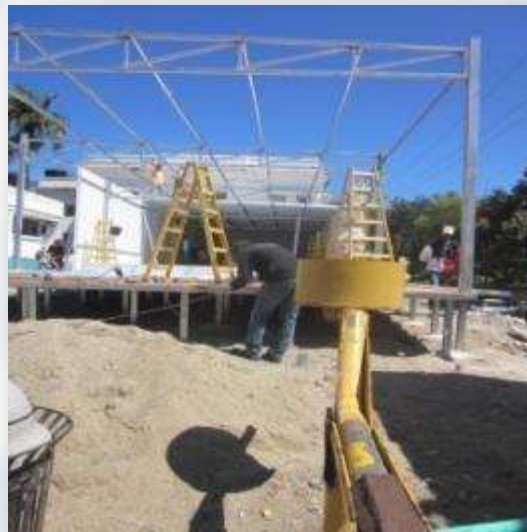
Trauma and Emergency Unit in Haiti