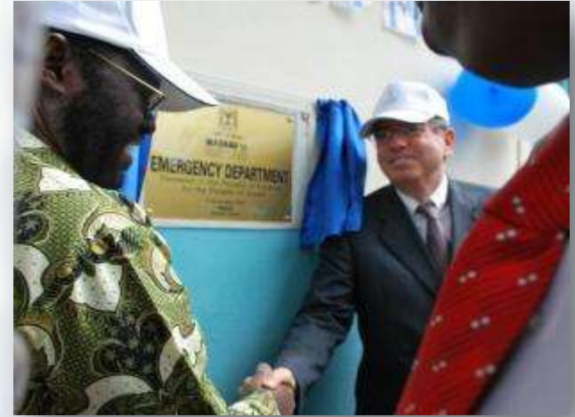
ER Construction in Kisumu, Kenya