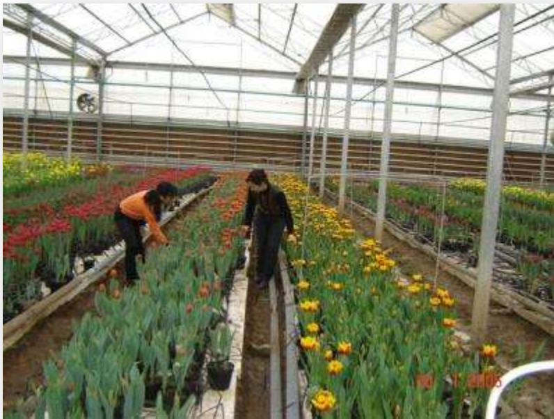
Xinjiang Sino-Israeli Demonstration Center for Arid Zone Agriculture