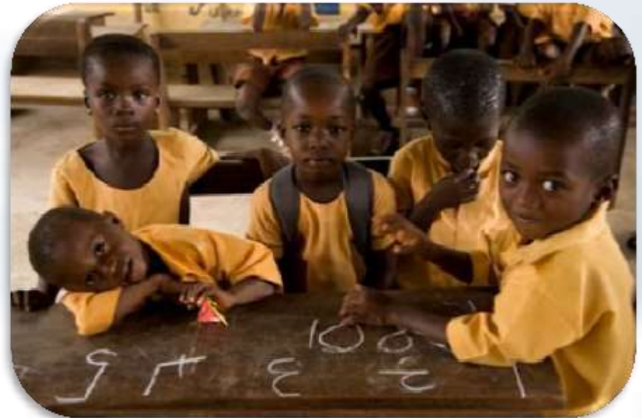
Early Childhood Education