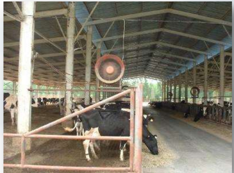
Yongledian Dairy Cattle Demonstration Farm