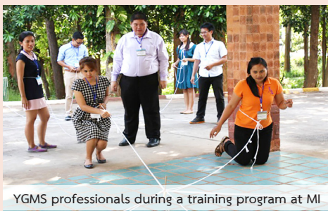
YGMS professionals during a training program at MI

In a three-month training program, the YGMS professionals are equipped with research capacity, basic facilitation skills, and conceptual understandings of regional cooperation. The training program continues with another three-month on-the-job training where all YGMS professionals exposed to actual work related to GMS emerging issues.