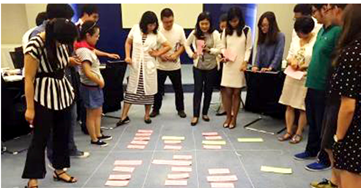
Participants collaborate as they strengthen their facilitation skills.

Guided courses were given to 31 Yunnan Power Grid Co., Ltd. (YNPG) staff members, who have been deemed as Resource Persons (RPs). North China Electric Power University, together with the MI faculty, conducted training courses that helped the participants improve their language and facilitation skills - emphasizing that these are useful tools in communicating technical aspects of the field.