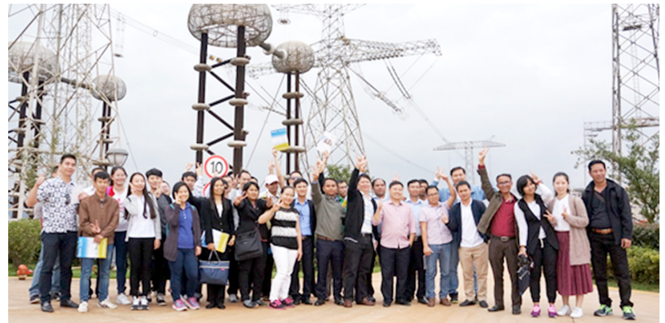
Participants paid a visit to the National Engineering Laboratory for UHV Technology in Kunming, China.

In 2016, this cooperative program moved forward with the project entitled Capacity Building on GMS Power Grid Interconnection and has successfully concluded its second year of implementation with productive results. The project followed four components.