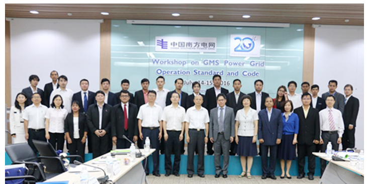
Participants of the workshop together with the MI team at the MI Headquarters.

They also acquired a better understanding of the quality and performance of China's power equipment through a four-day Structured Learning Visit to Honghe Power Dispatching and Control Center, Honghe Power Monitoring Center, 500kV Tongbao Substation, 500kV Tongbao Series Compensation Station, Nanzhuang Grid-connected Photovoltaic Plant, Yunnan Power Dispatching and Control Center, Vehicle-based Emergency Communication System and National Engineering Laboratory for UHV Technology.