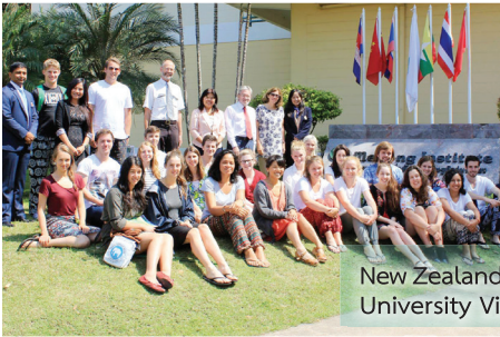
New Zealand Students from the Arcadia University Visit—Jan. 31, 2014