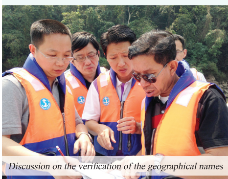
Discussion on the verification of the geographical names

It is noticed that communities in P.R. China, Lao PDR, Myanmar and Thailand spell and sometimes name identical geographic places on the Lancang-Mekong Channel differently. Therefore, miscommunications