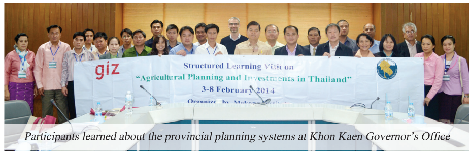
Participants learned about the provincial planning systems at Khon Kaen Governor's Office

On January 20-25 and February 3-8, 2014, the MI in collaboration with nine private companies, conducted two SLVs (Structured Learning Visits) as part of the efforts to improve Lao PDR's economy. More than 30 Lao government and GIZ officials based in Lao PDR participated in the SLVs.