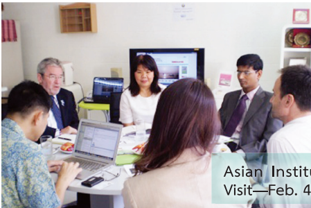
Asian Institute of Technology (AIT) Visit—Feb. 4, 2014