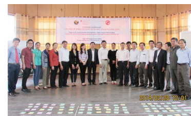
Group photo taken during 'LED Compass Workshops' in Vietnam