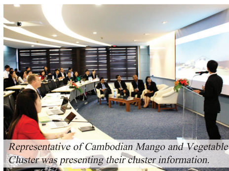
Representative of Cambodian Mango and Vegetable Cluster was presenting their cluster information.

into the international or global markets by providing market linkage opportunities for them.