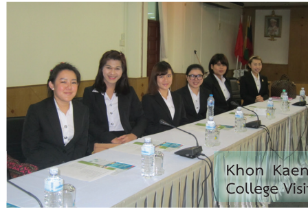
Khon Kaen University International College Visit—Jan. 7, 2014