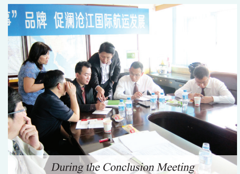
During the Conclusion Meeting

The aim was to review and ensure common understanding of locations as well as find a way to standardize names for geographic features, including villages, towns, wharfs, ports, and