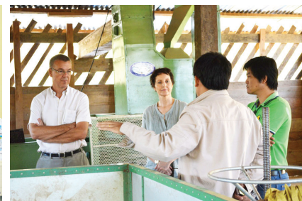
SDC Monitoring Team visited Rice Seed Producers Group on Jan. 30-31, 2014 in Khammouane Province, Lao PDR.