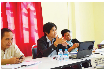
Khammouane Local Project Partners Meeting on Jan. 27, 2014 at Lao Field Office

The MI along with the Swiss Agency for Development and Cooperation (SDC) are proud of the progress made by the East-West Economic Corridor (EWEC) Project towards “Capacity Building for a More Inclusive and Equitable Growth, GMS.” This is the first MI long-term project that has approached development activities at the provincial level by working with and through local host sites and partners. Below are some of the highlights from various MI programs and trainings that took place between January and March 2014: