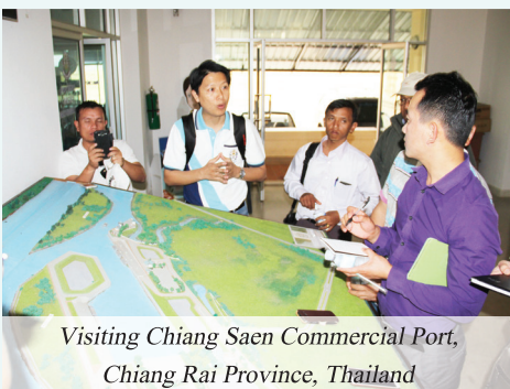
Visiting Chiang Saen Commercial Port, Chiang Rai Province, Thailand

(Con't from 1st page).....for the geographic places serves as a prerequisite for executing the plan. As such, this standardization will promote the economic development of riparian regions, benefit area residents, and positively impact regional trade.