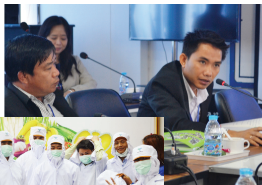
Participants visited the processing facilities of Taniyama Siam Co., Ltd., Nakhon Pathom province.

During the SLVs, the participants received first-hand information and were exposed to agricultural planning system in Thailand. Information shared with the participants included prioritizing agricultural products and criteria for the prioritization, strategy to promote products in the prioritized sectors, the process of translating the national strategy into sub-national implementation plans, and the cooperation among private sector, public sectors and farmers/communities in this promotion.