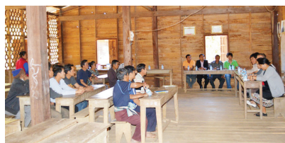
SDC team met with 'Organic Rice Farmer Group' on Jan. 30-31, 2014 in Namakba Village, Khammouane Province, Lao PDR.