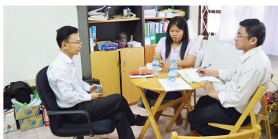
Field officers visited 'Rice Value Chain Advisor' on Feb. 23 - March 1, 2014 in Khammouane Province, Lao PDR.

In order to provide effective capacity building program to target local development partners in EWEC project, a baseline study was conducted during March 24-27 in three project sites—Hpa-an, Khammouane and Quang Tri. The baseline collected data provided base line value indicators which will be used to measure the quality of RLED-EWEC Project and assist in setting milestone objectives for each work activity to define the target group for capacity development until 2015. It will, as well, confirm the verification source for each monitoring indicator.