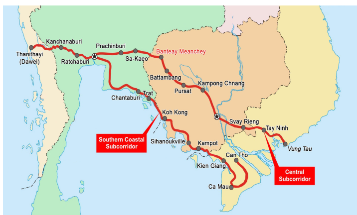
Provinces on the borders of the SEC where the project will be implemented

To address these issues, the project focuses on capacity development for stakeholders and beneficiaries, targeting three groups including (i) Local production groups/associations; (ii) Provincial and Border Government Officials; and (iii) Chambers of Commerce and Industry and SME associations. Different development approaches to boost the project's impact have been adopted to implement a series of activities under three components. Shown below are the provinces on the borders along the SEC where the project will be implemented, as well as the three components under which activities will be implemented.