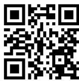
GMS Statistics Database