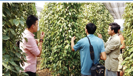
Cambodia February 26 - March 2

In collaboration with Yezin Agricultural University and the Department of Agriculture in Myawaddy Township, MI completed the field data collection for cross-border contract farming research in Myawaddy, Myanmar. The field survey was carried out in four villages located along the border of Tak, Thailand. The results of the survey will serve as basis for improving contract farming arrangements to ensure benefits to small-scale farmers.