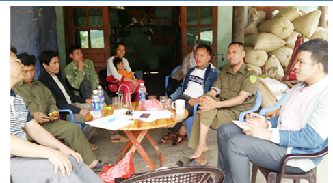
Vietnam March 5 - 10

MI conducted the primary field data collection in four villages randomly selected from two communes in Kampong Trach District, Kampot Province, Cambodia. The survey was carried out using focus group discussions, key informant interviews and individual interviews with contractual and non-contractual farmers, contracting companies, traders and a range of other actors from concerned government agencies.