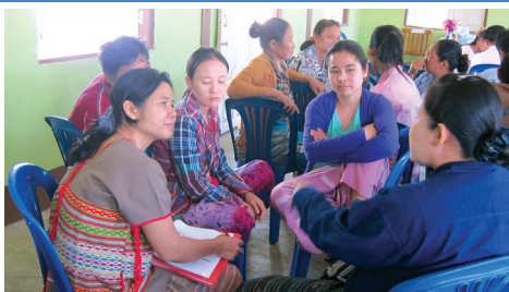
Myanmar February 22 - 24

In collaboration with Yezin Agricultural University and the Department of Agriculture in Myawaddy Township, MI completed the field data collection for cross-border contract farming research in Myawaddy, Myanmar. The field survey was carried out in four villages located along the border of Tak, Thailand. The results of the survey will serve as basis for improving contract farming arrangements to ensure benefits to small-scale farmers.