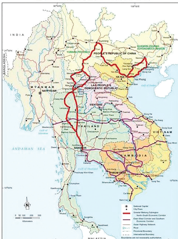
GREATER MEKONG SUBREGION ECONOMIC CORRIDORS

The cross-border trade and investment on North-South Economic Corridor (NSEC) is low despite the remarkable improvement of road infrastructure and favorable government policies and bilateral and multilateral agreements among countries in the Greater Mekong Sub-region (GMS). The major causes of this low utilization of the connectivity and enabling environment are mainly on: a) NSEC implementation process failed to be taken up by the private sector, b) higher costs of transportation and logistics, c) lack of information and knowledge on trade and investment potentials and d) lack of opportunity for private and public officials to have opened discussion environment.