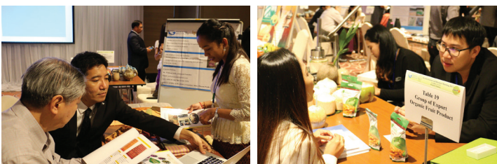
SMEs present their products to potential investors during the on-site business matching.

The Investor Forum and Business Matching was organized as part of MI’s ongoing project, Enhancing Competitiveness of Small and Medium-sized Enterprises along the Southern Economic Corridor (SEC) of the ASEAN Mekong Sub-region , supported by the Japan-ASEAN Integration Fund (JAIF). Realizing the vital role that foreign direct investments play in enhancing the competitiveness of SMEs and promoting technology transfer, the Forum set out to facilitate the business linkages of SMEs in the provinces of the SEC with prospective foreign investors, thereby supporting their integration into regional and global value chains.