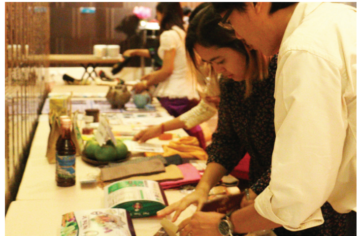
Participants check product samples on display.

Small and medium enterprises in the Greater Mekong Sub-region (GSM) account for nearly 98% of enterprises in the Mekong countries, and provide employment to roughly 70% of the national workforce. Despite this, the GMS SMEs’ share in the gross domestic product and export earnings has remained relatively low at best. This can be attributed to a host of factors. National and regional business environments aside, SMEs in the region face internal constraints, primary of which is the limited market information and commercial intelligence, which in turn effectively limits them from acting as suppliers to foreign investors. Access to market, technology and innovation and skills development opportunities are also limited.