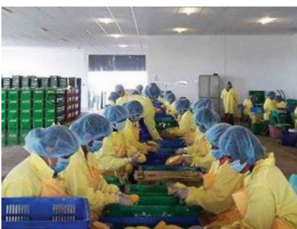
Workers hard at work in a food processing company in Cambodia.

Small- and medium-sized food enterprises (SMEs) are the backbone of Cambodian economy. However, the country’s food manufacturing sector continues to face numerous challenges in ensuring that the food processed and distributed, especially by local agro-processors, are safe.