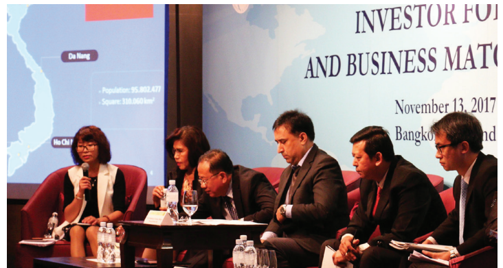
Panelists discuss investment opportunities in the GMS.

Many of the SMEs that came to participate in the Business Matching were initially matched through the SEC Business Database ( www.sec4business.com ), a platform that contains the SMEs’ business profiles and technology