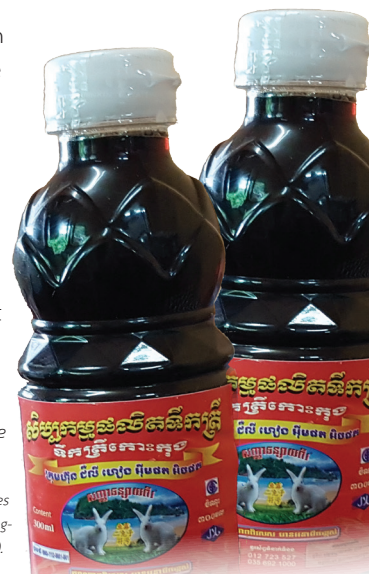
Koh Kong-made fish sauce

This story is part of the SEC Project Success Stories series ( http://www.mekonginstitute.org/what-we-do/ongoing-projects/southern-economic-corridor/success-stories/ ).