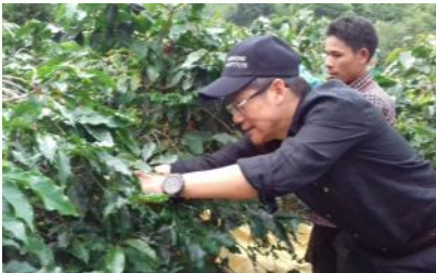
MI Team brings Thai media to RLED-EWEC sites in Vietnam to introduce activities and project partners.