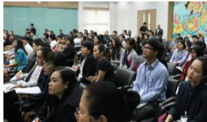
Food safety is an issue that cuts across sectors and borders as the symposium gathered various stakeholders from Asia, Africa and the US.