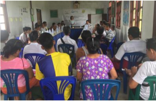
Farmers in Hpa Luu Gyi Village select their farmer group officials as adoption of the tripartite models gets underway.

RLED-EWEC's Myanmar Field Office continues its work with farmer groups in Myawaddy with a capacity-building training on Formation and Strengthening of Farmer Group organized together with Awba Company. Held on September 28, 2017, about 32 farmers joined the training in Hpa Luu Gyi Village, Myawaddy.