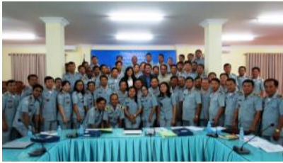
The quest for safer food continues with the Training-Workshop on Food Safety Risk Analysis and Audit for food inspectors in Cambodia.

MI and the Cambodia Import-Export Inspection and Fraud Repression Directorate General (CAMCONTROL) delivered a Training-Workshop on Food Safety Risk Analysis and Agri-Food Inspection and Audit last