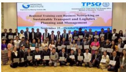
Working for a better transport system. Participants of the Regional Training on Sustainable Transport and Logistics Planning and Management gather for a final group shot.

MI successfully concluded the two-week Regional Training cum Business Networking on Sustainable Transport and Logistics Planning and Management on October 6, 2017.