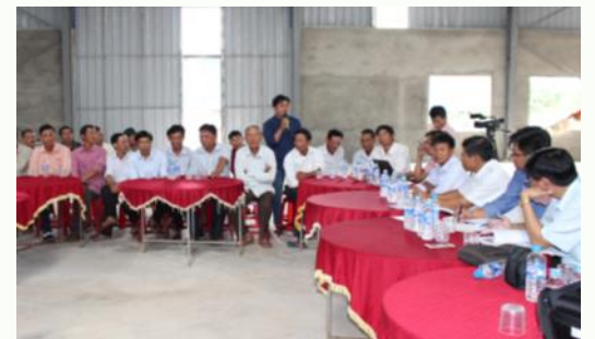
Coffee farmers and local enterprises discuss ways and mechanisms for cooperation.

To further develop the coffee sector, the RLED-EWEC Project has also joined hands with the EMEE Project of World Vision to provide technical support in the direct market linkage of 15 farmer groups, thereby increasing the total number of coffee farmer groups to 32 with more than 800 members. Remarkably, this year has seen increased cooperation of farmer groups with each other and the formation of an alliance that enables resource sharing and better negotiation of prices and other preferential conditions for the members.