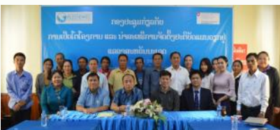
RLED-EWEC Lao Team and project partners plan next steps forward during the inception workshop.