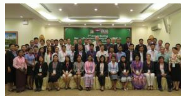
Committed to agricultural development. The ADC Team with other stakeholders at the MELA meeting.

Colombo, Sri Lanka on October 19-21, 2017. The UN-FAO organized the meeting to validate the findings of its stocktaking study in Asia. The meeting participants drafted a regional program to support the sustainable development of small scale forest enterprises in Asia. Read more.